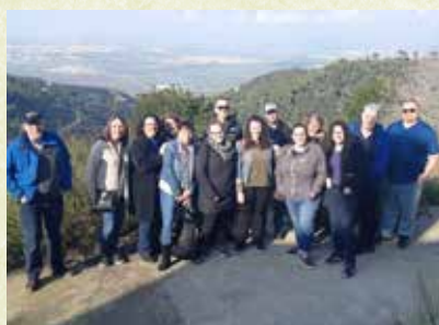
Rochester Education Bridge Delegation in a Druze Village near Haifa, Israel