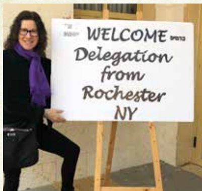
Welcoming the Rochester Education Bridge to Cramim